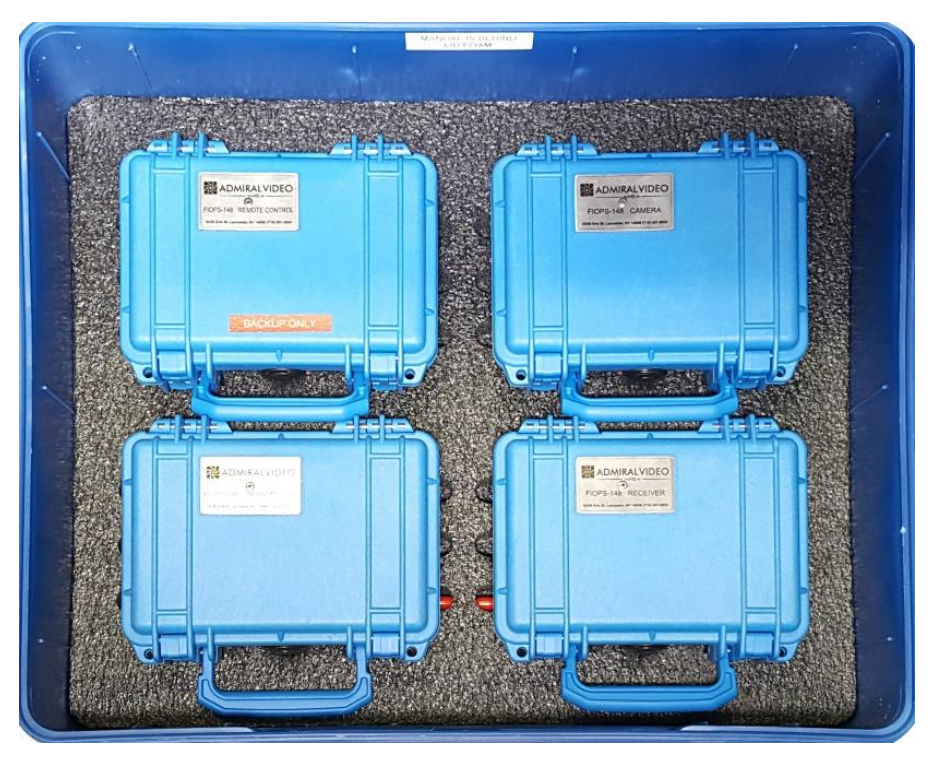
The four Pelican cases fit in the bottom layer.