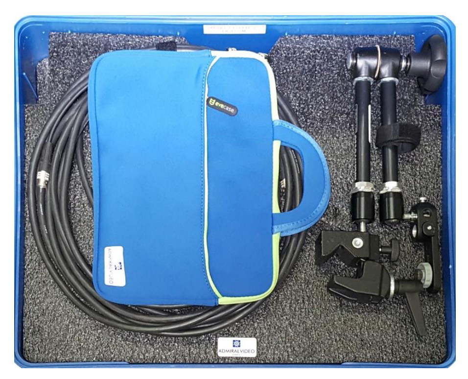
The foam divider and remaining parts are placed on top.