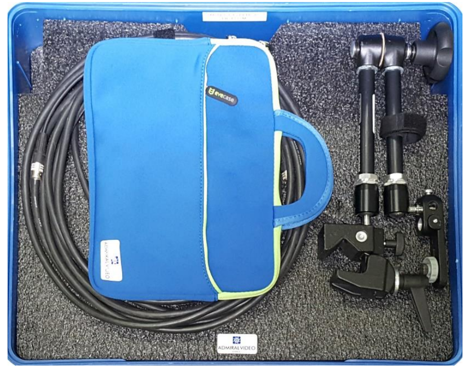
The foam divider and remaining parts are placed on top.