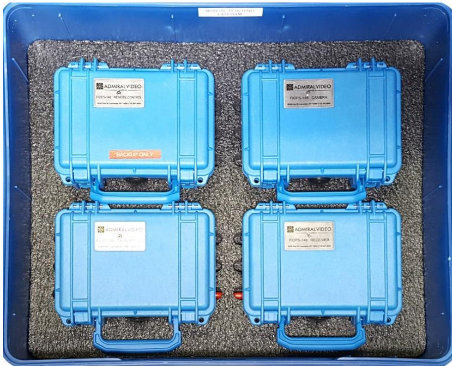
The four Pelican cases fit in the bottom layer.